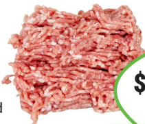
Hunan Lean Minced 绞肉 WAS $1.56