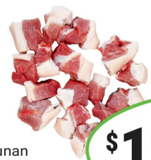
Hunan Stew Pork 扣肉 WAS $1.98