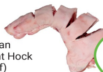
Hunan Front Hock (Half) 猪手 WAS $1.28