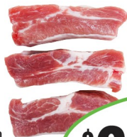
Hunan Shoulder Prime 特排 WAS $2.99