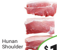
Hunan Shoulder Lean Skin-On 前赤带皮 WAS $1.59