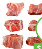
Hunan Pork Soup Bone 汤骨 WAS $1.89