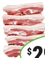
Hunan Belly 肚肉 WAS $2.38