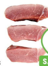
Hunan Lean Pork 后赤 WAS $1.68