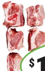
Hunan Pork Ribs Cut 肉骨 WAS $1.98