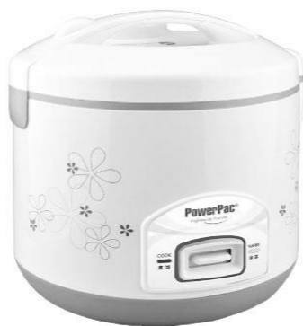
买满 $500-$1000 POWERPAC 1.8公升电饭锅 PPRC18A