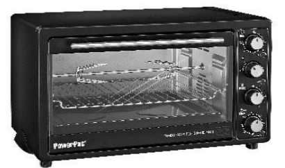
买满 $3501以上 POWERPAC 30公升烤箱 PPT30