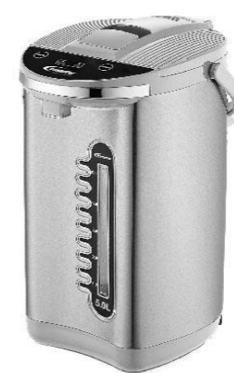
买满 $2001-$3500 POWERPAC 5公升自动保温电热水瓶 PPA70A/S